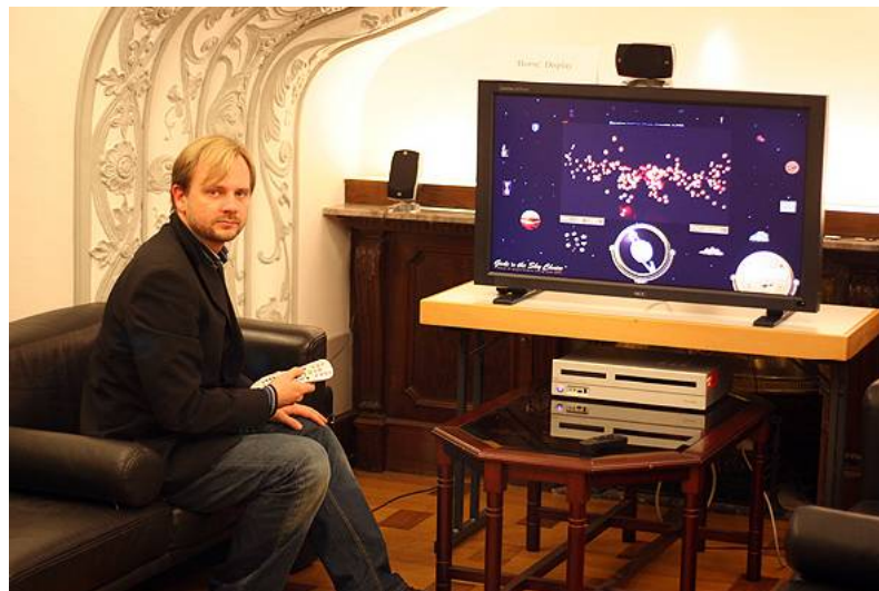
Gods in the Sky Choice on a via Windows Media Center

In Gods in the Sky Choice , the material can be reconfigured according to topic - such as culture, planet, god, historical period, scientific discovery, or a number of other themes - in each of the three modes.