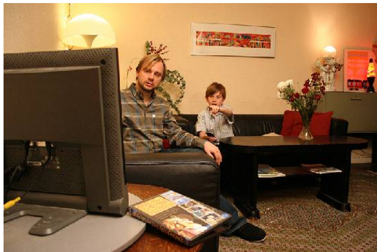
Gods in the Sky Choice pilot demonstrator presented in a living-room environment

The NM2 productions are bridging the gap between "lean back" consuming and "lean forward" active participation and are best enjoyed in a living room experience using a Windows Media Centre PC and a large screen.